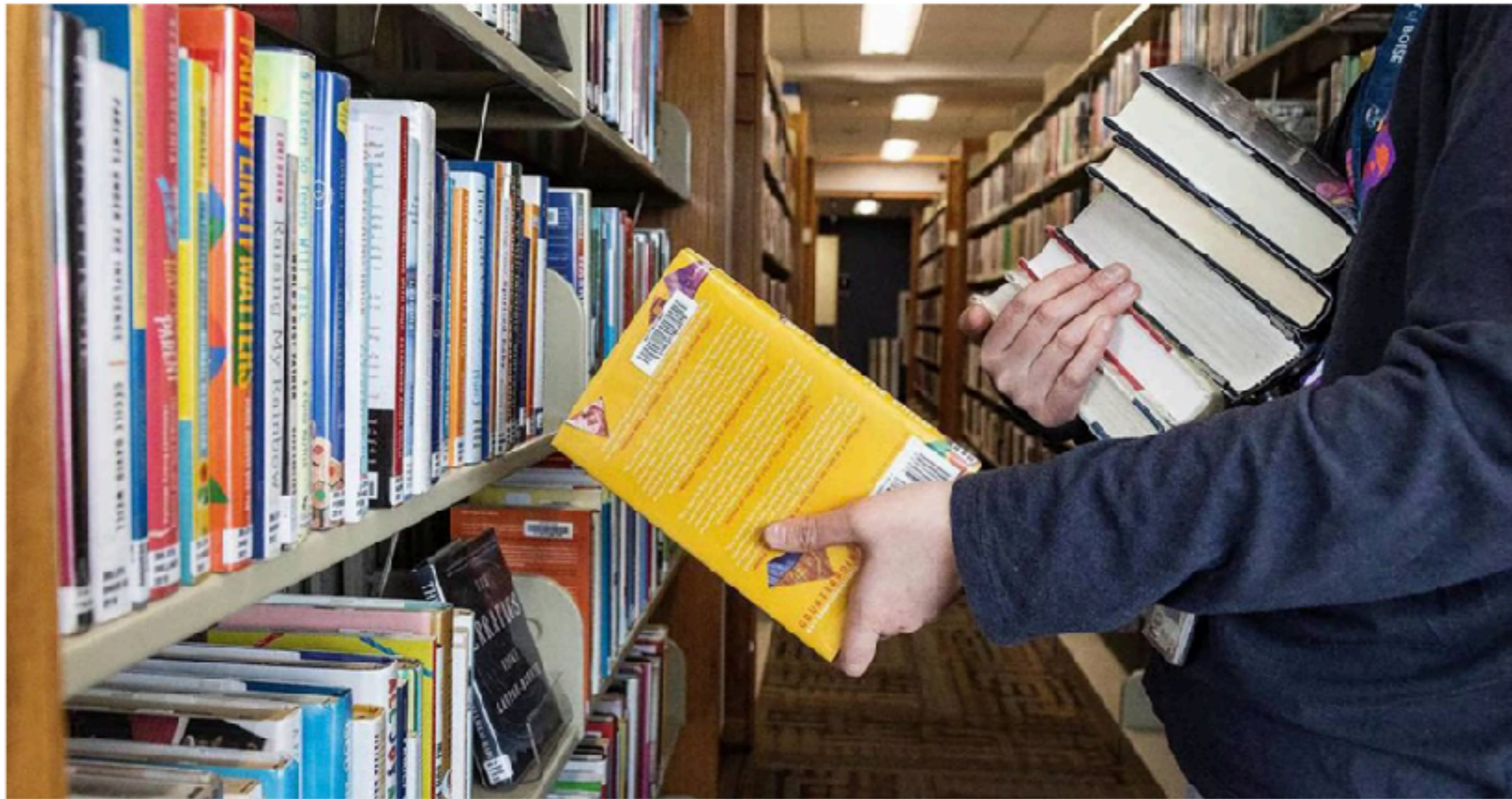
A librarian returns books to the shelves.